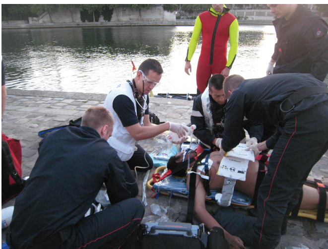
Figure 1: Case management of a drowned person in Seine river waiting for ECMO at prehospital level

The patient was transferred in our Intensive Care Unit for further management. Upon arrival in intensive care the patient's condition worsened, with circulatory and respiratory failure. Mean arterial pressure (MAP) was below 65 mmHg despite volume expansion and, arterial blood gases with FiO 2 = 100% and PEEP = 10 cmH 2 O showed a combined acidosis with severe hypoxemia (pH = 7.12, PCO 2 = 52 mmHg, PO 2 = 38 mmHg, HCO 3 - = 16.9 mmol.L -1 , lactate = 6.2 mmol.L -1 ). Central body temperature was 35°C, without abnormalities on the ECG. Echocardiography was only possible in subcostal view and showed visually conserved left ventricular ejection fraction and signs of low right atrial filling pressures. However it was impossible to get a workable apical and parasternal views. This was later explained by chest radiography findings ( Figure 2 ); which revealed bilateral lung infiltrates and a small pneumomediastinum. Noradrenaline was started and rapidly increased up to 2 mg.h -1 and volume expansion was continued under echocardiographic control. The patient was deeply sedated and paralysed with atracium. Ventilatory settings were altered. In particular PEEP was increased, in accordance with the ARDS net protocol. These therapeutic